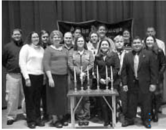
NEW PETITIONING GROUP Texas Lutheran University San Antonio, TX

The Interest Group at Texas Lutheran University held its Petitioning Ceremony February 2, 2002. This ceremony was conducted by Active Members from the San Antonio Area Chapters. The group currently has 25 Petitioning Members and recently recruited 36 Pledges! Since it was started last March, the group has already provided over 500 hours of community service, holds weekly fellowship events and attended a CPW and a Regional Conference. The members plan to retain 100 percent of the pledges recruited this spring, attend the Section 43/44 Conference, hold their first CPPC, host a Merit Badge University for the Alamo Area Council BSA, and attend the 2002 New Orleans National Convention. They hope to charter this spring.