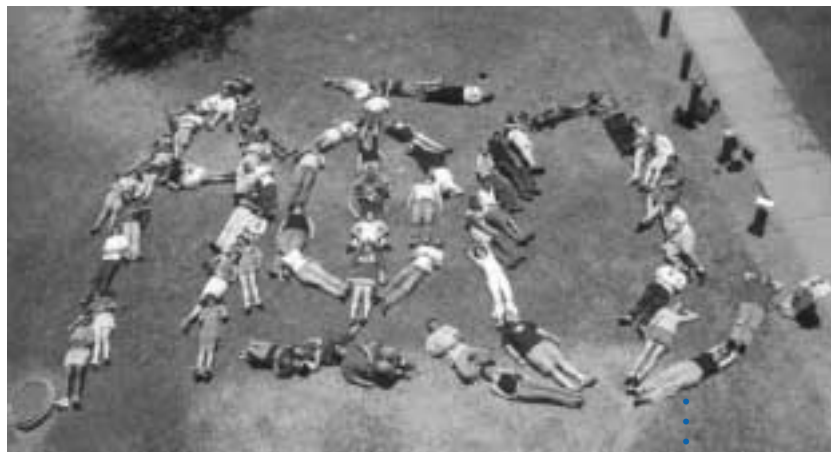
CHAPTER PROGRAM WORKSHOP University of Virginia Charlottesville, VA

The Interest Group at Texas Lutheran University held its Petitioning Ceremony February 2, 2002. This ceremony was conducted by Active Members from the San Antonio Area Chapters. The group currently has 25 Petitioning Members and recently recruited 36 Pledges! Since it was started last March, the group has already provided over 500 hours of community service, holds weekly fellowship events and attended a CPW and a Regional Conference. The members plan to retain 100 percent of the pledges recruited this spring, attend the Section 43/44 Conference, hold their first CPPC, host a Merit Badge University for the Alamo Area Council BSA, and attend the 2002 New Orleans National Convention. They hope to charter this spring.