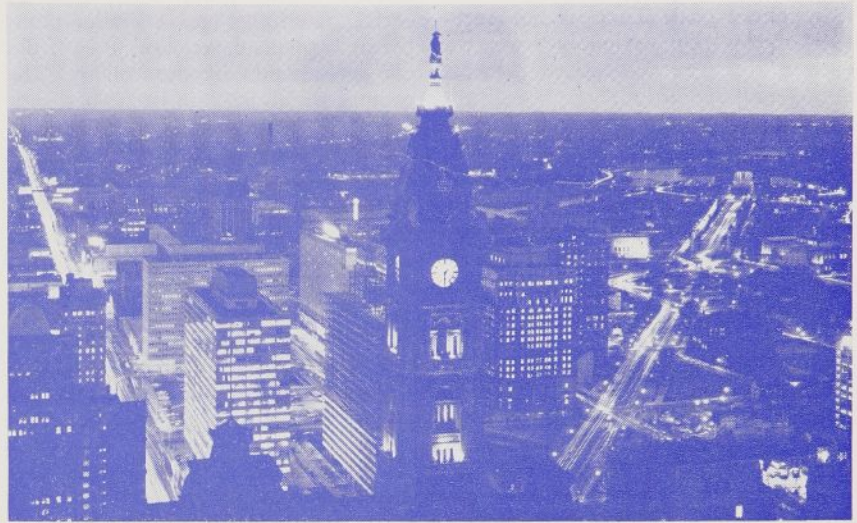
Historic Philadelphia will be awaiting ALPHA PHI OMEGA on December 28-30, 1960. Shown above is a twilight view of Central Philadelphia.