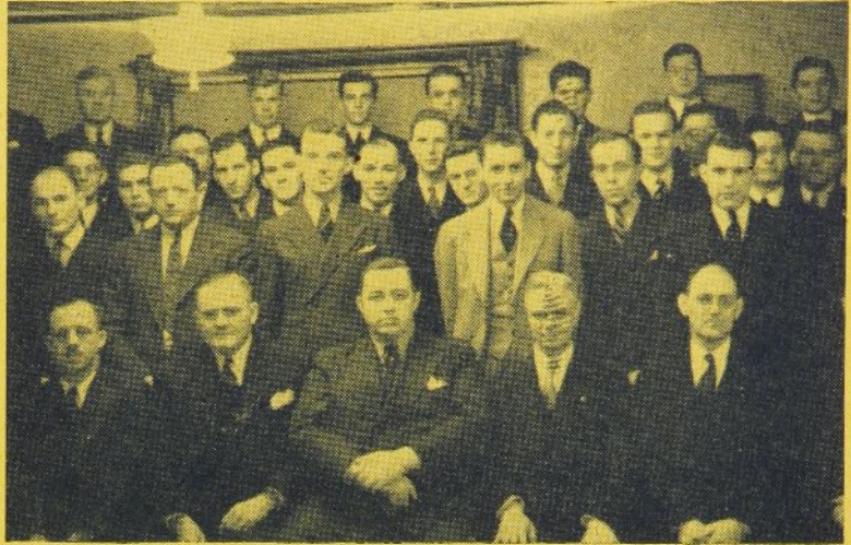
The Charter Members of Beta Beta Chapter, Installed April 24, 1937, at Michigan State College

A scholarship of $200 to the University of Kansas City will be awarded this spring to an outstanding and deserving Eagle Scout of the Kansas City Council. The committee charged with selecting the recipient of this scholarship is composed of chapter officers, and Faculty and Scouting Advisors.