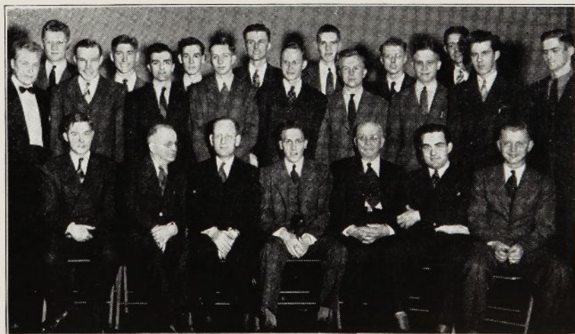
The charter members of Gamma Psi Chapter, installed April 18 at the University of Minnesota.