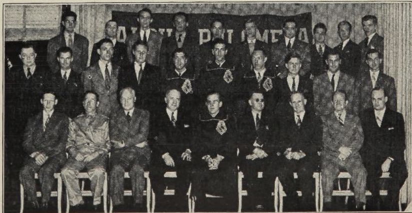
Charter members of Alpha Phi Omega at the University of Cincinnati, installed May 26, 1942.