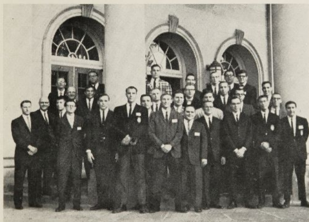
Members of Omicron Alpha, Kutztown State College, posed for this group photo following their installation on May 11.

The members, in addition to the chapter officers, are: