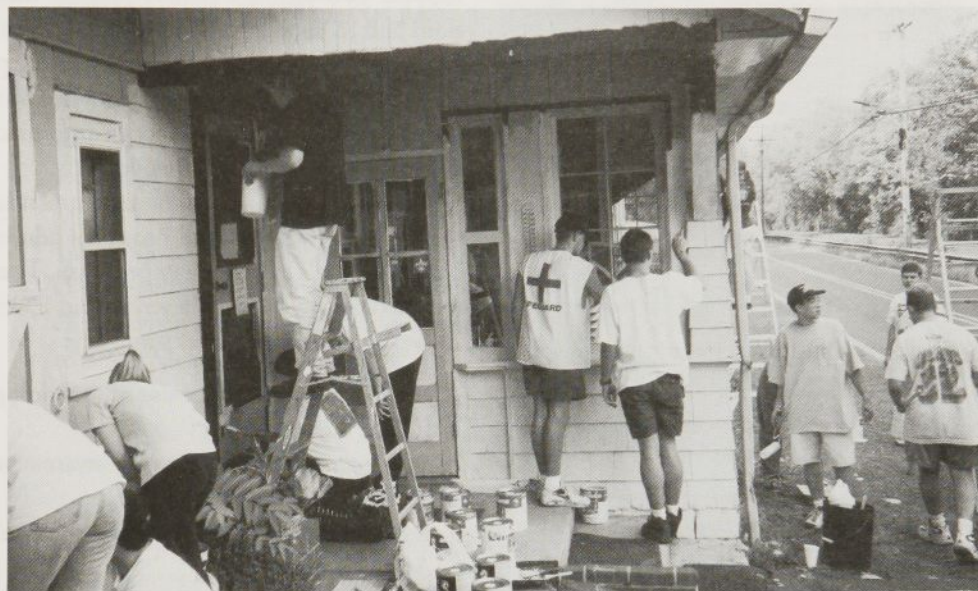
Brothers of Alpha Gamma Iota Chapter apply a much-needed coat of paint to the exterior of the Ranger's house as part of their weekend of activities on Treasure Island.