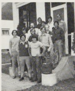
Delegates to the Section 23 Chapter Presidential Conference

Minnesota Chapter Presidents attended the annual Section 23 Presidential Conference in Minneapolis last month. The following chapters were represented: Gamma Psi, University of Minnesota; Theta Nu, Hamline; Iota Tau, St. Olaf; Lambda Epsilon, St. Cloud State; Sigma Theta, St. Mary's College; Upsilon Upsilon, College of St. Thomas; and Chi Iota, Bemidji State.