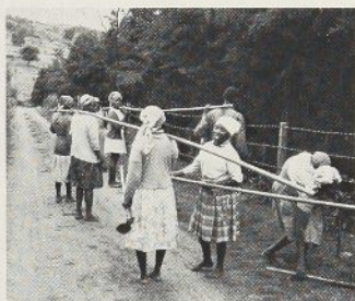
Kijabe Villagers carrying pipes for their new water system.

Emerging from the cloud cover, we look down the escarpment overlooking a section of the great Rift Valley, which stretches southward through Kenya and into Tanzania, its far side discernible only as an uneven band of deep violet. It is in this setting that we discover the remote little farm community of Kijabe, whose residents are keenly aware of Alpha Phi Omega.