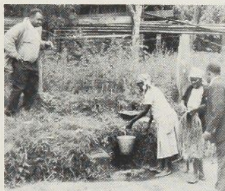
Women draw water from water system financed by Alpha Phi Omega.

Approximately 50 miles northwest of Nairobi, the terrain becomes hilly, nearly mountainous. The clouds swoop low as the elevation rises. Trees and vegetation become more dense; fewer people are seen . . . only an occasional boy leading a burro, or a woman expertly balancing a water jug on her head. We are completely enveloped in the fog of a low cloud as we reach the crest of the climb and start down again.