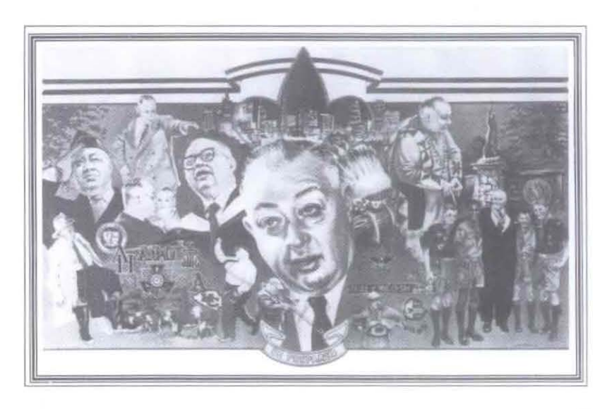
The new Bartle Memorial in Kansas City can be remembered by purchasing a 12 x 18 four-color framed reproduction. For further information on this unique item of Bartle memorabilia, please write or call the National Office of Alpha Phi Omega.