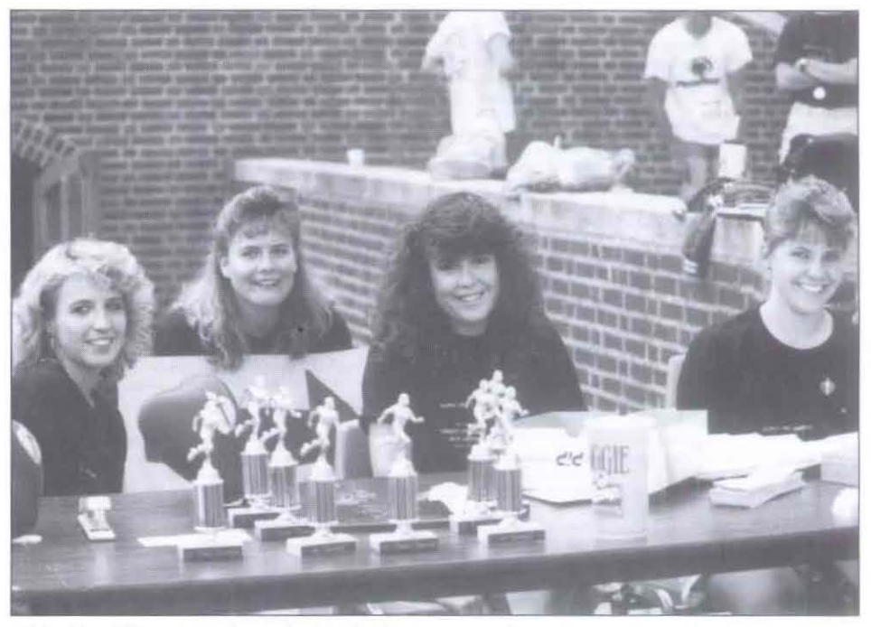
Alpha Beta Chapter raised over $1,650 for the Heart Association.