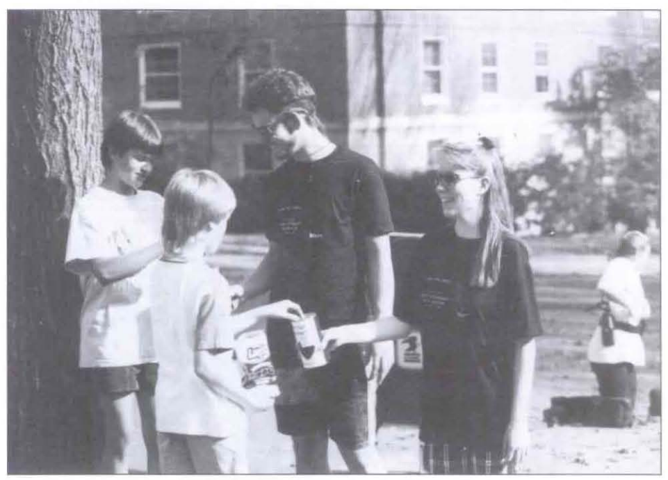
"Canning" on campus and in Pittsburgh resulted in the sale of 820 raffle tickets.