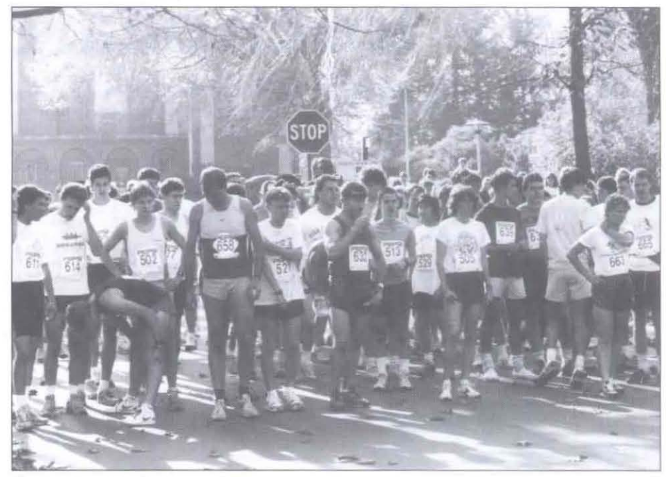
Runners to your marks!

Finally, after all the preparation, fund-raising and the race itself, Alpha Beta's brothers and pledges relaxed with a cookout. The Road Race had ended, for now. But preparation for the 10th Road Race is just weeks away.