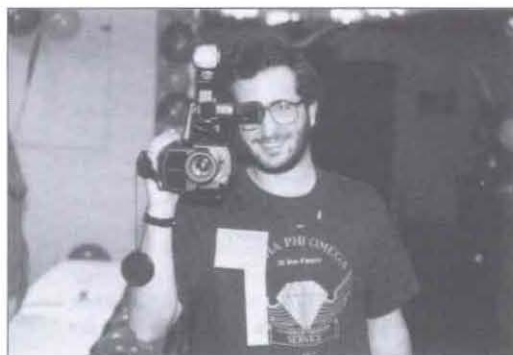
Please smile....I'm with APO news!