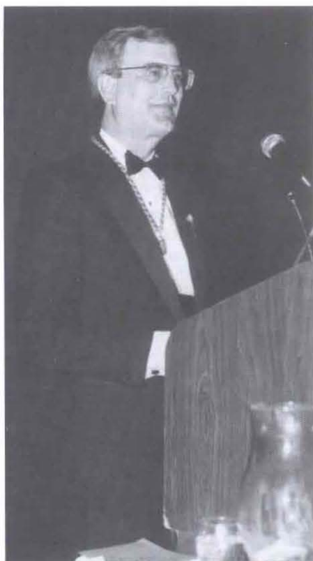
Our new National President...