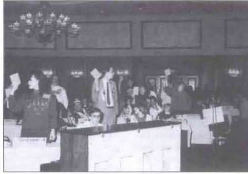
Voting in the delegates assembly —