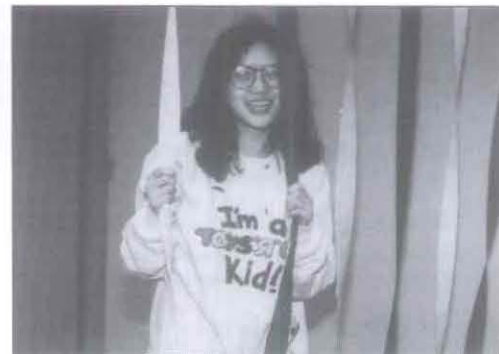
A brother in "jail" was one of many at the Convention Carnival that helped raise funds for Ronald McDonald House—$1,000.00.