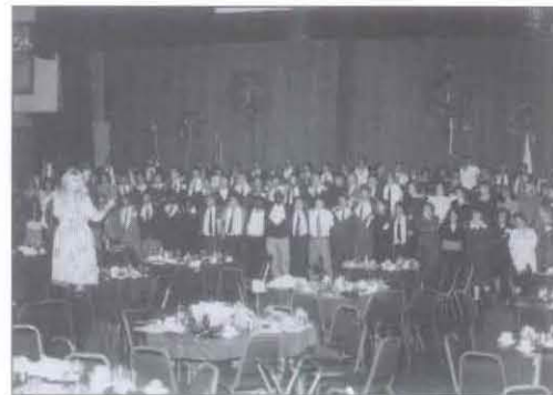
The toast song at the final banquet was awesome.