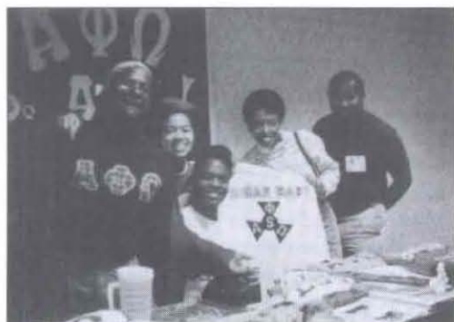
Brothers had fun at chapter displays.