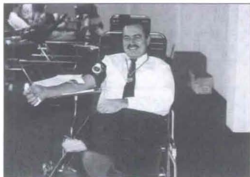
Our blood drive attracted many famous donors...over 80 pints collected!