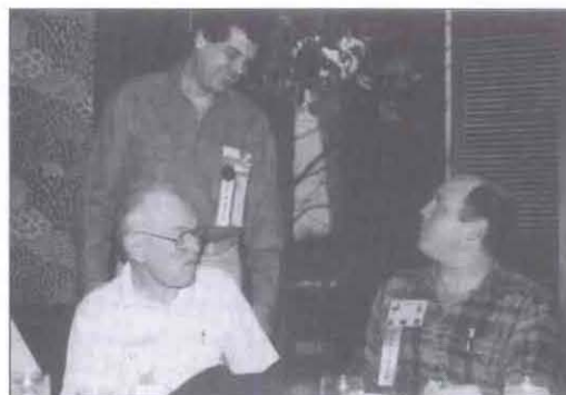
A breakfast honored our Chapter Advisors and Sectional Chairmen.