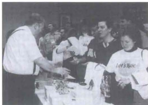
Merchandise sales were "hot".