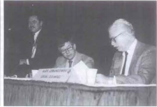
The President observes while National Executive Director and Legal Counsel confer.