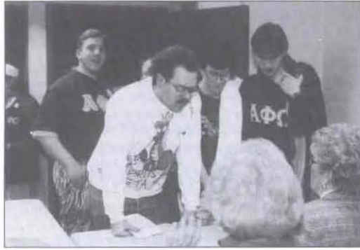
Registration... is always fun!