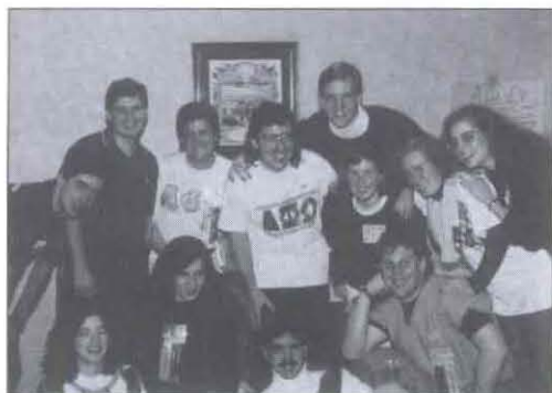
These happy faces and 1469 other brothers attended our St. Louis Convention representing 177 chapters.