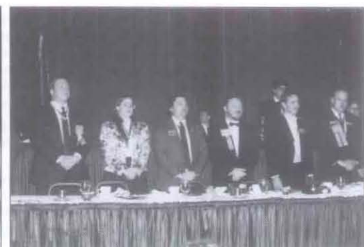
The Convention recognizes the new elected Members-at-Large.