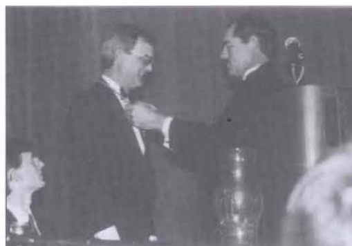
The passing of Presidential privilege —