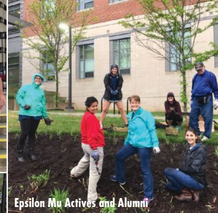
Epsilon Mu Actives and Alumni