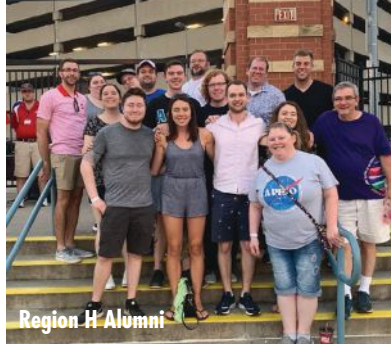
Region H Alumni

All APO brothers, both active and alumni, are encouraged to participate in National Service Week. This year, National Service Week will be held November 1-7 and will focus on the theme “Diabetes Awareness in Your Community.” Check out the Juvenile Diabetes Research Fund (JDRF) website and the American Diabetes Association website for more information about diabetes and ways to volunteer.