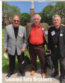
Gamma Iota Brothers