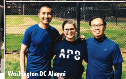
Washington DC Alumni