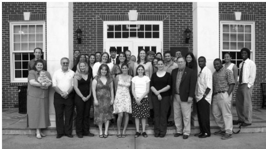
RHO BETA CHAPTER Armstrong Atlantic State University Savannah, GA

Rho Beta Chapter at Armstrong Atlantic State University in Savannah, Georgia, held its re-chartering ceremony on August 28, 2004. A total of 14 new members represent this chapter.