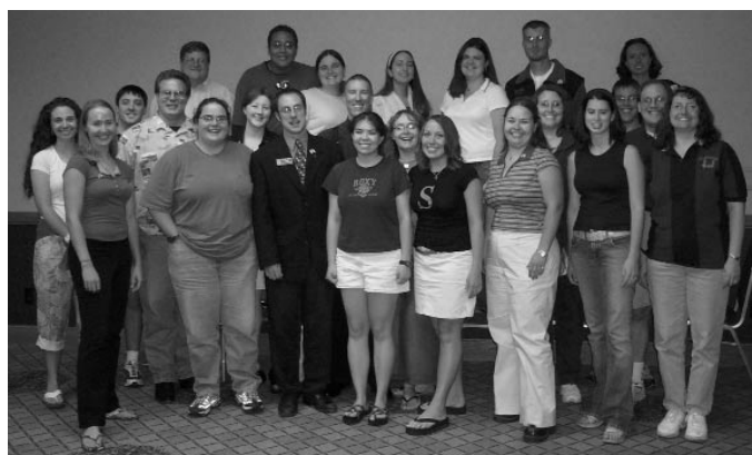
Members of the 2004 Convention Planning Committee (pictured above) have devoted numerous hours of their personal time to make this event the best ever!

We have an obligation to celebrate 79 years of Leadership, Friendship and Service... something special that you don't want to miss!