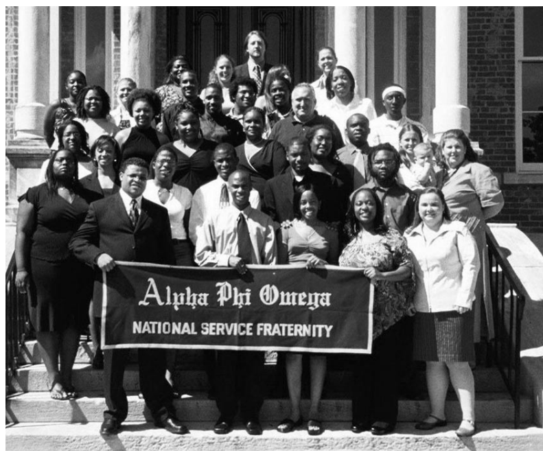
OMEGA LAMBDA CHAPTER Fisk University Nashville, TN

Rho Beta Chapter at Armstrong Atlantic State University in Savannah, Georgia, held its re-chartering ceremony on August 28, 2004. A total of 14 new members represent this chapter.