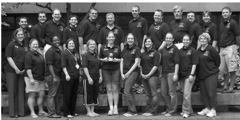
Pictured above: Alpha Phi Omega's 2006 National Convention Planning Committee

As we prepare for our 39th Biennial Convention – Alpha Phi Omega's greatest celebration that occurs once every two years – we should take a moment to think about the theme of this year's event. Unbridled: running free; unrestrained enthusiasm; unhampered service – doing as much service as we can to support our nation, communities, campuses and Fraternity.