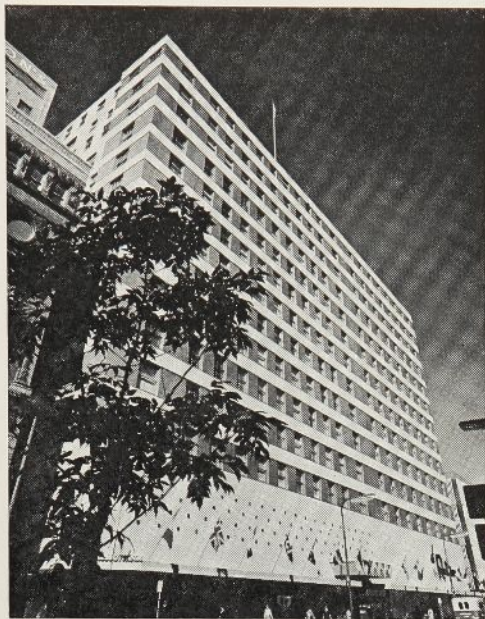
The Radisson Hotel, Minneapolis, pictured above, will be official headquarters for APO's Nineteenth National Convention.