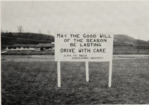
Pictured above is the "Drive With Care" sign erected by Brothers of Xi Iota, Susquehanna University, Selinsgrove, Pennsylvania.