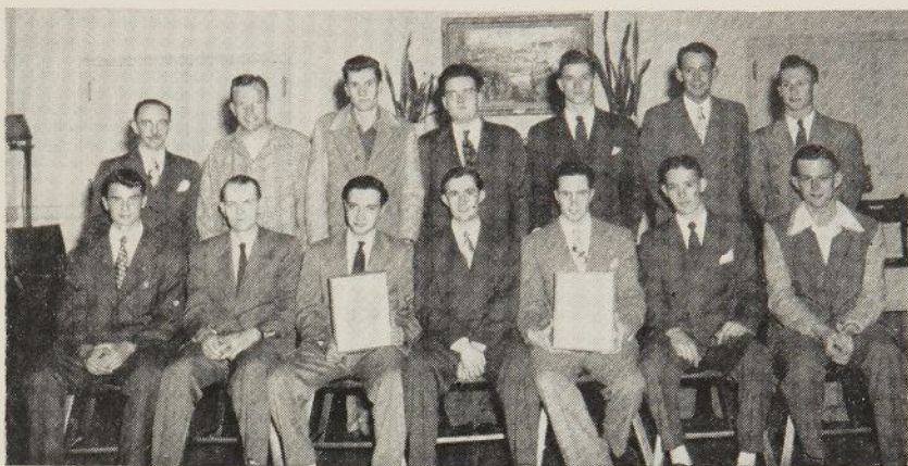
This group of brothers put Alpha Theta Chapter back "on the map" at the University of Omaha last Spring and have enlarged their activities during the Fall months.

lions are in need. Untold suffering is not a thing of the past. Opposing armies are no longer viciously thrust at each other's vitals disregarding all manner of life in their way, but "peace" has by no stretch of the imagination brought succor to those who survived the holocaust. A real need for humanitarian "Service" exists. A host of relief and rehabilitative agencies have rushed into this obvious breach. Alpha Phi Omega as a service agency can do a creditable good by contributing it's share of support. By salvaging an innocent victim of war's ravages today, an appreciative advocate of democracy will arise in a better tomorrow.