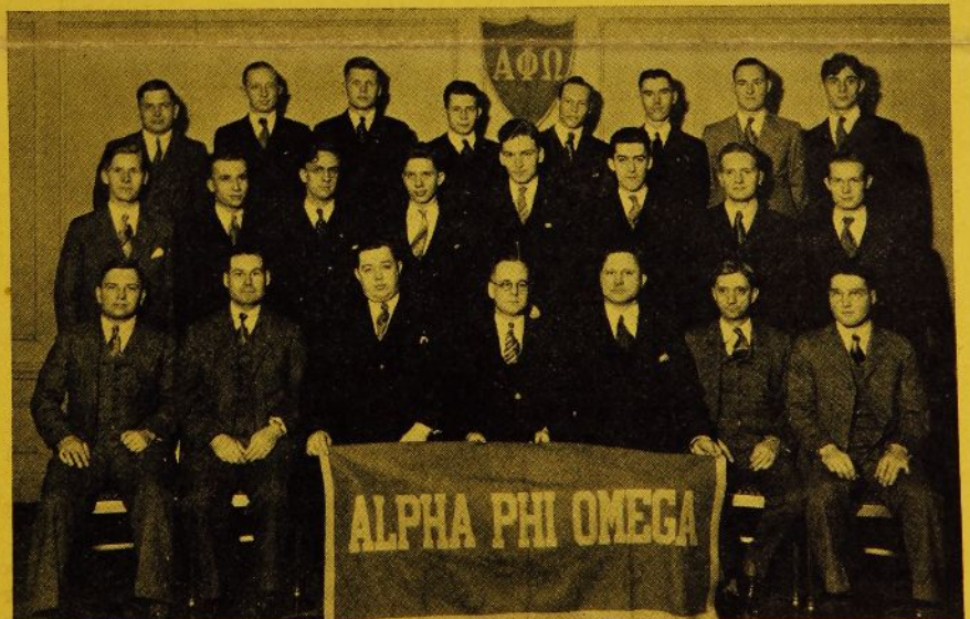
The Delegates attending the Third National Convention of Alpha Phi Omega, Jefferson Hotel, St. Louis, Missouri, March 1st and 2nd.