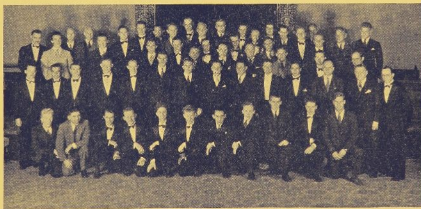
Participants in the Installation of Alpha Kappa Chapter at the University of Southern California, Los Angeles, June 3, 1934