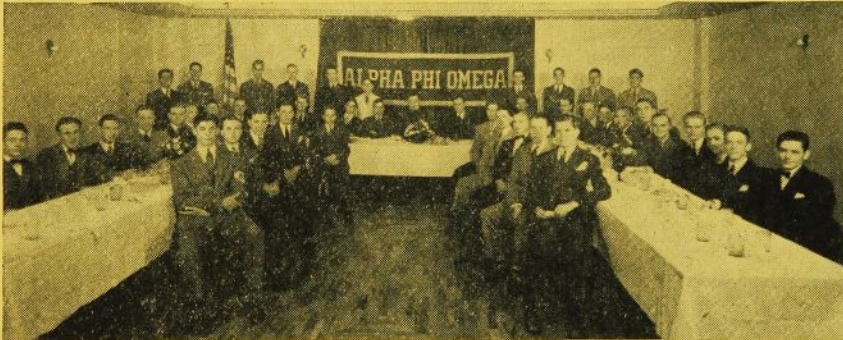
This picture shows the charter members of Beta Psi Chapter at the Southeast Missouri State Teachers College, installed May 12, 1939.

May 21, 1939, was an important day on the campus of the Northwest Missouri State Teachers Col-