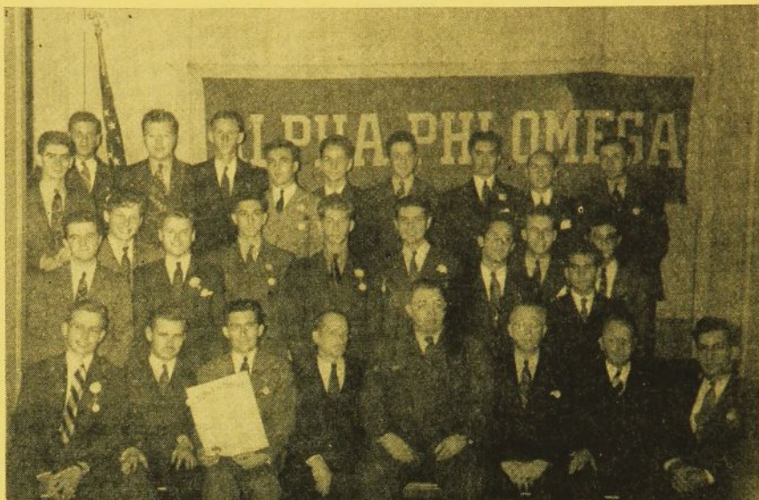
Shown here are the Charter Members of Gamma Epsilon Chapter, installed September 24, 1939, at The City College, College of the City of New York.