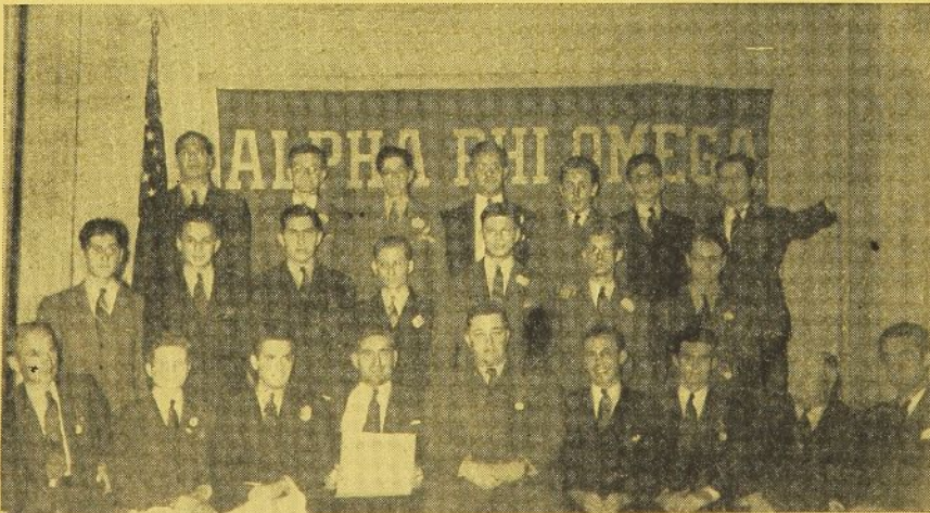
In this picture are the Charter Members of Gamma Delta Chapter, installed September 24, 1939, at the School of Business and Civic Administration, College of the City of New York.