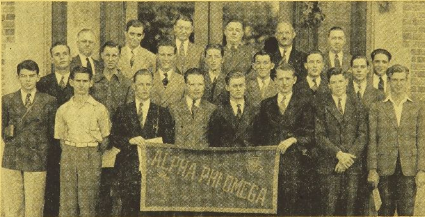
The Charter Members of Beta Upsilon Chapter at the Northwest Missouri State Teachers College, installed May 21, 1939.