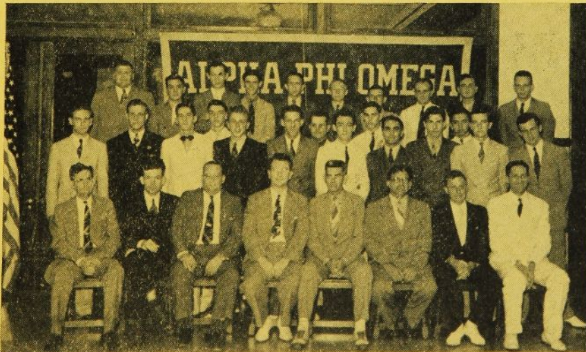
The Installation Group of Beta Phi Chapter, installed May 19, 1939, at the Southwestern Louisiana Institute.