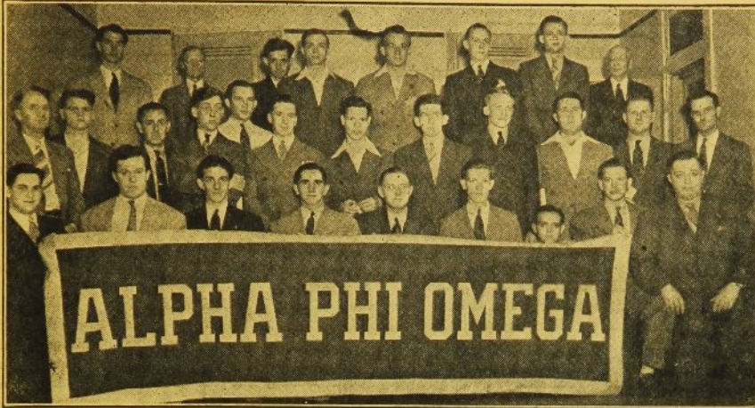
The charter membership of Gamma Mu Chapter at Evansville College, Installed May 21, 1940.

ana University, Alpha Gamma at Purdue, Alpha Tau at Butler, Alpha Upsilon at DePauw, Beta Lambda at Indiana State and Gamma Mu at Evansville.