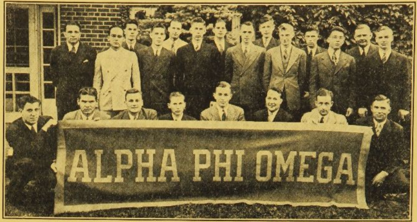
This picture shows part of the charter members of Gamma Nu Chapter at the University of Idaho, installed May 25, 1941.