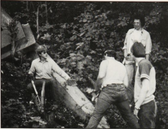
The Brothers of Epsilon Zeta have spent many long hours clearing and cleaning the area known as "The Approach" on the Rensselaer campus.