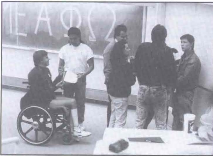
Attending brothers role-played scenarios at the Region VIII conference seeking to reflect attitudes on how we address our chapter membership.