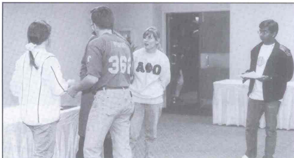
All college students who may share our ideals should be made to feel welcome and needed.

The purpose of Alpha Phi Omega is to gather college students together under the principles of the Boy Scouts of America in order to de-