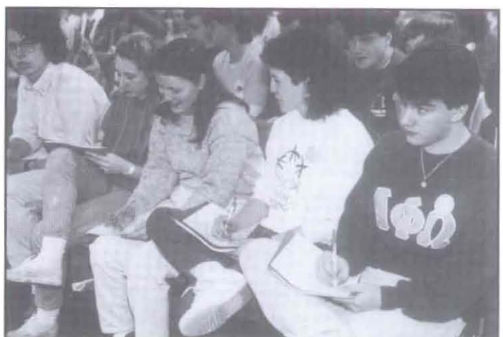
"Write down a list of ten people to join you on your journey ..."