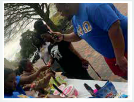
Sigma Mu Chapter at Virginia Union University apo sigmamu Cool down with Sigma Mu!