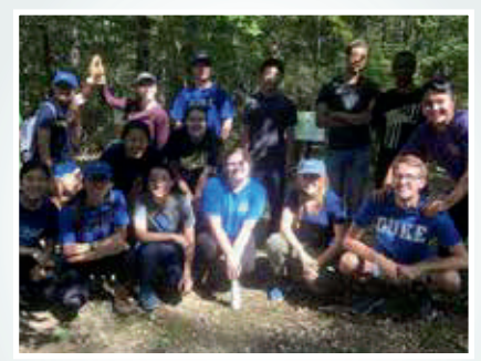
Lambda Nu Chapter at Duke University dukeapo From info sessions to a Duke Forest volunteering event, APO had a successful first week of recruitment.