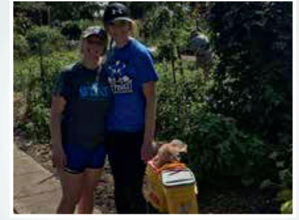
Beta Lambda Chapter at Indiana State University apoindstate Two of our awesome brothers volunteered for Sycamore Service Saturday at the ISU Community Garden!