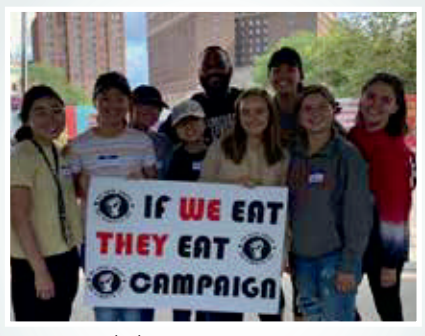
Phi Chapter at Syracuse University apocuse Brothers supported the Syracuse community at We Rise Above the Streets!