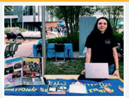
Tau Mu Chapter at the University of South Florida apotaumu Stop by and ask us questions about our brotherhood for Fall 2019 recruitment.