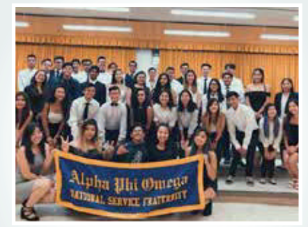
Lambda Mu Chapter at California State University, Los Angeles apocsula Say hello to our 2019 Fall Pledge Class! Good luck on your pledging process!