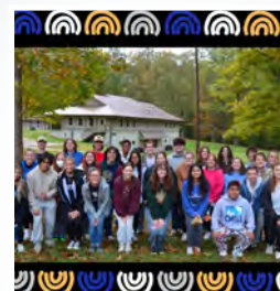
Alpha Zeta Chapter at the University of Kentucky

@kylalphamega: We had the BEST time at retreat this weekend!! It was a blast spending time in fellowship, leadership, and service with each other.