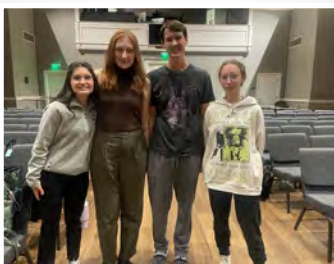
Omicron Tau Chapter at Alma College

@apo_almacollege: We were so excited to get to meet with our new members for their first pledging ceremony