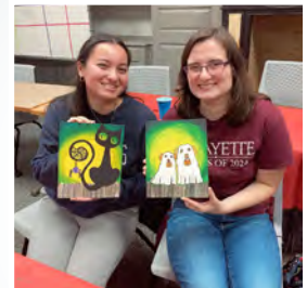
Alpha Chapter at Lafayette College

@apolafayette: We had so much fun with our paint and sip night with @lafayettelava yesterday! So spooky