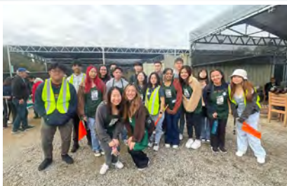
Iota Phi Chapter at the University of California at Davis

@apoiotaphi Thank you to those who helped out at the Arboretum Plant Sale this past Saturday! It was a huge success! Here's a quick recap of our brothers before and after doing service!