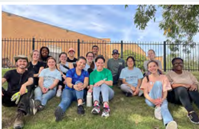
Gamma Rho Chapter at the University of North Texas

@untapogamarho: Make a Difference Day, Oct 22nd, 2023