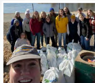
Lambda Rho Chapter at Augustana College

@augieapo: Our siblings cleaned our park today!!