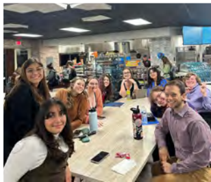
Alpha Beta Psi Chapter at Roanoke College

@rc.apo: Our Brothers have been busy serving looks and the community