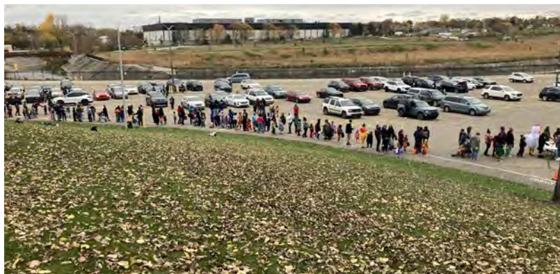
Community members lined up to enter the event.