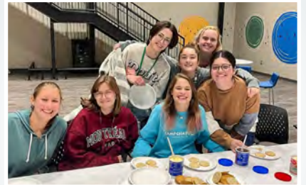
Pi Iota Chapter at Wofford College

@wofford_apo: Swipe to see some flashbacks from Fall 2022 and Spring 2023 Rush!!!