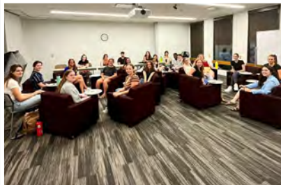
Eta Phi Chapter at American University