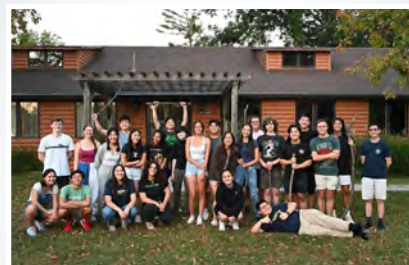
Kappa Chi Chapter at Creighton University

@apo.kappachi: still can't stop thinking about retreat ... and our amazing brothers of course!