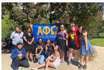
Sigma Beta Chapter at the University of Redlands