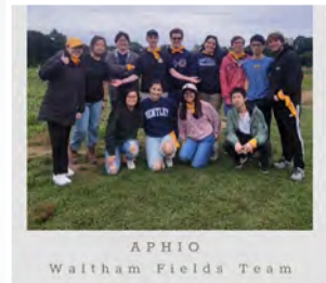
APHIO Waltham Fields Team