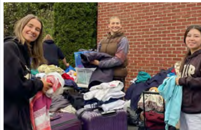
Eta Gamma Chapter at Union College

@apounioncollege: Some flics from our trip to street soldiers today!