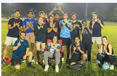
Alpha Gamma Chapter at Purdue University

@purdueapo: A shout to the APO Intramural's Soccer Team for winning last night's tournament! Let's congratulate our brothers and wish them luck on next week's game.