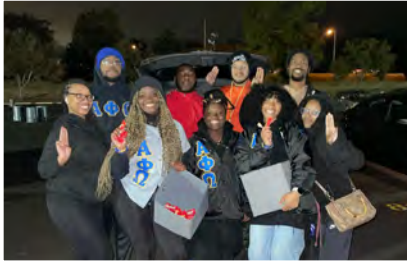
Pi Epsilon Chapter at Alabama A&M University

@aamu_apo: Yesterday evening, The Pi Epsilon Chapter of Alpha Phi Omega National Service Fraternity, Incorporated volunteered at the Annual Echos Trunk or Treat! It was a pleasure giving out candy to all of the kids and seeing the fantastic costumes!