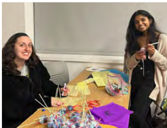
Nu Theta Chapter at Rowan University

@apo_rowan: Meet us & @rowanrelayforlife at the student center today from 1:30-4:30 and grab yourself a SPOOKY cake pop!!