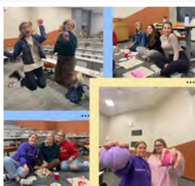
Beta Theta Chapter at the University of Wisconsin-Madison