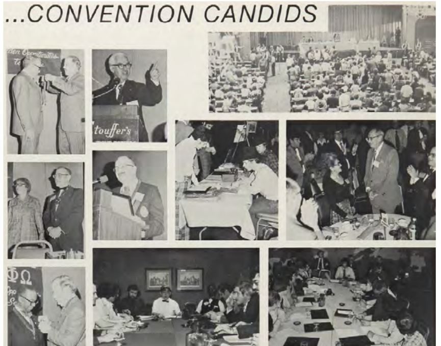
A collection of photos published in the 1975 Winter-Spring edition of the Torch & Trefoil .