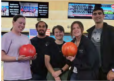
Alpha Delta Nu Chapter at Embry-Riddle Aeronautical University